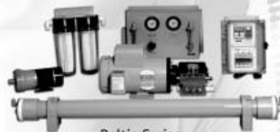
Baltic Series 200-1800 GPD

A Wide-Range Of WaterMakers For All Boating Applications