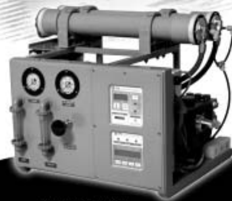
Aegean Series 200-800 GPD