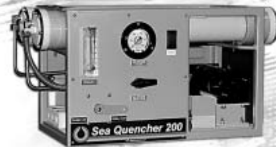
Sea Quencher 200-400 GPD