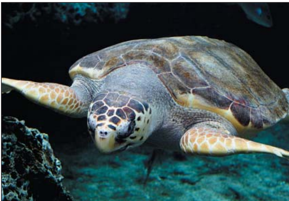
File photo A loggerhead turtle: Researchers found 45,084 nests for the threatened loggerhead turtles, Florida's lowest nest count in 17 years.

While the number of loggerhead nests has been shrinking, green and leatherback turtle nests are showing an increase, in many cases at the same beaches. There's no simple answer for this disparity, said Anne Meylan, who coordinates the statewide